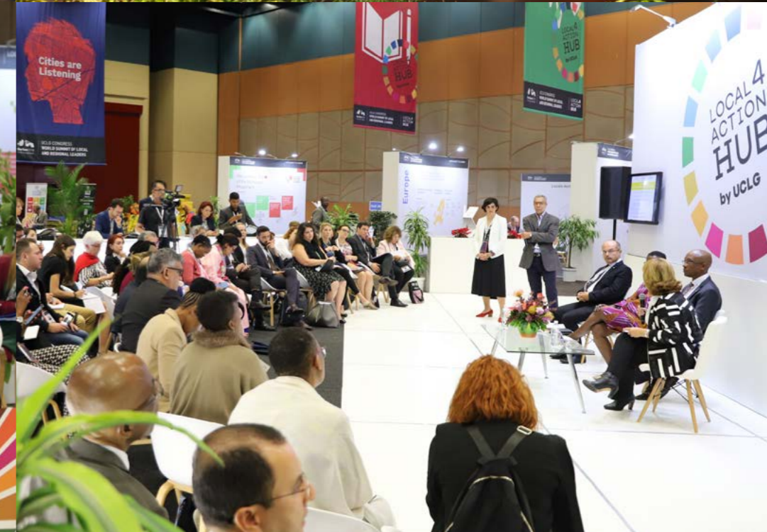
6th UCLG Congress 2019 in Durban, Africa